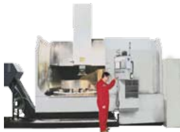
Youji CNC VTL Ø80" x 47" height