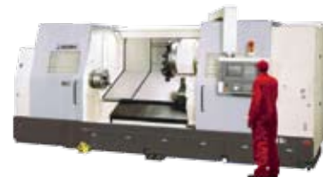
Okuma LB 45 CNC Lathe Ø26" x 118" length