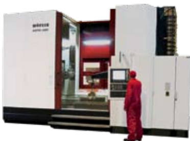
Höfler Rapid 1500 CNC Rapid Gear Grinder Ø60" x .75 DP