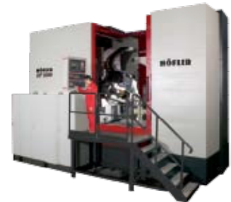
Höfler HF 1600 CNC Hobber Ø63" x .75 DP