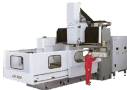
Kao Ming Double Column CNC Mill Ø80" wide 127" long