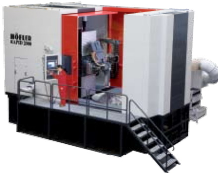
Höfler Rapid 2600 CNC Rapid Gear Grinder Ø102" x .50 DP